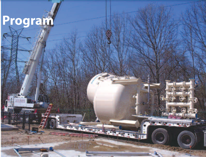
Carbon filters being lowered into the ground at Plant 4.